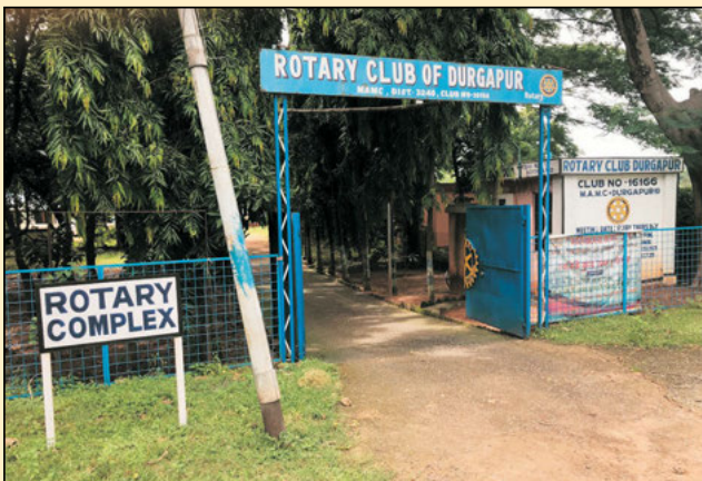
Complex of RC of Durgapur