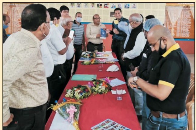
Members witnessing exchange of flags