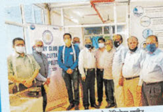
जैन हॉस्पिटल एंड रिसर्च सेन्टर हावड़ा को वेंटिलेटर मशीन प्रदान करने के दौरान उपस्थित रोटरी क्लब ऑफ कलकत्ता मेट्रोपोलिटन के पदाधिकारी।