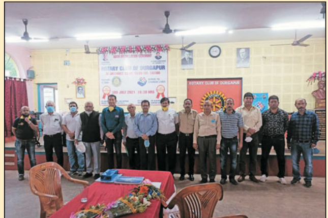
Group photo of members of both Clubs