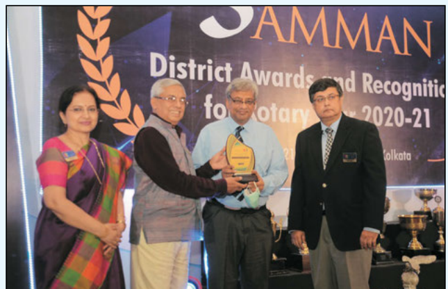
Trophy given for Care for Physically & Mentally Challenged