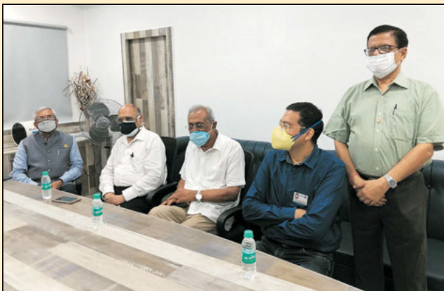
A View of RCCM Team