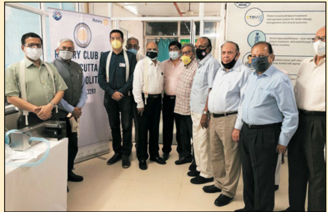
Group photo of RCCM members and Hospital representatives