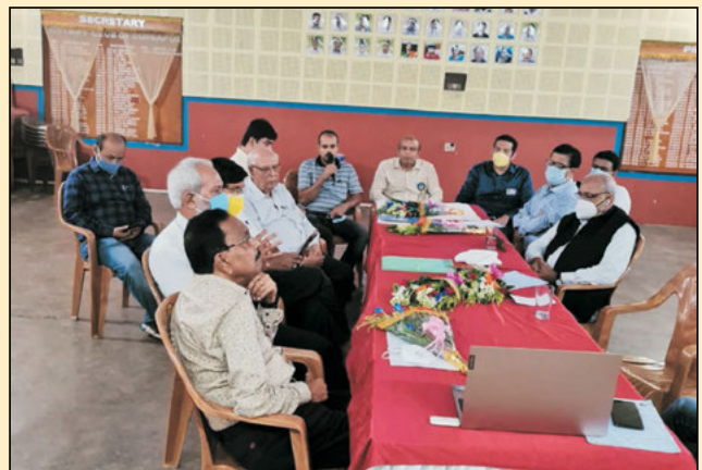
A view of Joint regular meeting progress